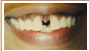
Lorum Ipsum Dolor >>