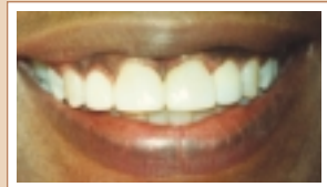
Lorum Ipsum Dolor