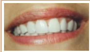
Lorum Ipsum Dolor