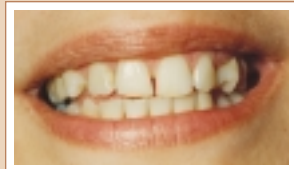
Lorum Ipsum Dolor >>