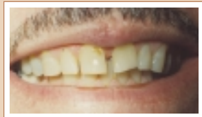
Lorum Ipsum Dolor >>