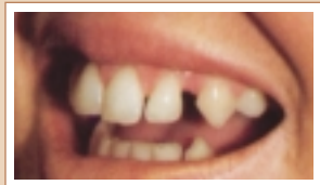
Before – Bonding used to close spaces >>