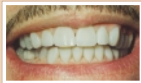
Lorum Ipsum Dolor